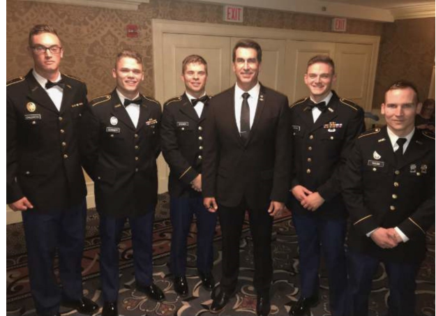
Cadets who attended the Veterans of America Conference in Washington D.C. pose with retired LTC and actor/comedian Rob Riggle.