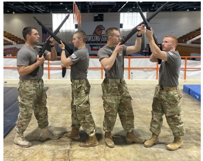
Thank you to everyone who donated to Army ROTC during BGSU 1 Day of Giving. This year the money was used to buy new rifles for Pershing Rifles! All of your support and generosity is greatly appreciated!