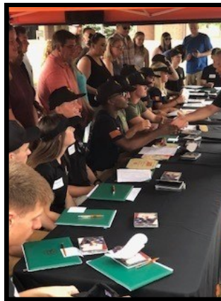
Newly contracting Cadets signing contracts

The fall orientation will take place 24-28 August 2020. This orientation serves multiple purposes. It is a time for our incoming freshman to move-in to their dorm rooms early and get acquainted with other Cadets in ROTC. This experience will drastically ease the transition for the freshman as they take this next big step in their lives. This week also gives Cadets the opportunity to complete administrative requirements, draw gear from the supply room, conduct physical training, and complete invaluable training, to include weapons qualification, ACFT, and more. This is also a time for the parents of these students to meet the Cadre and get a better understanding of our ROTC program.