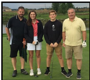
ANNUAL GOLF SCRAMBLE