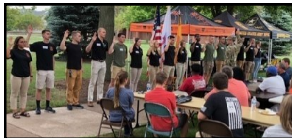
Cadets taking the Oath