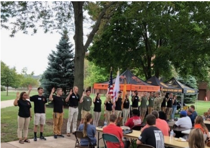
Lieutenant Colonel Army gives the Oath of Enlistment to newly contracted Cadets.

On August 20, 2019, new and returning ROTC Cadets gathered for the annual Fighting Falcon Battalion Family Cookout. The Cadets and their families had the opportunity to meet the new members of the program, learn about what ROTC has to offer, and congratulate the newly contracted Cadets. The following day, Cadets took part in Cadet Orientation where they learned some of the basics of being a ROTC Cadet and got to know one another. BGSU Fighting Falcon Battalion welcomes new Cadets and is excited to start another successful semester!