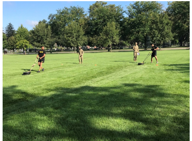
Cadets take on the ACFT (Army Combat Fitness Test) during orientation week to experience the new Army Fitness standards.