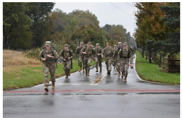
Cadets finish the final ruck march