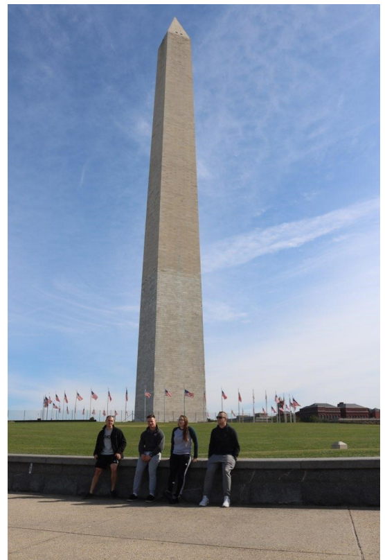
Cadets in front of the Washington Monument