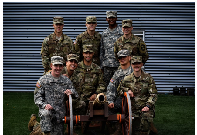
Pershing Rifles Cadets pose with cannon