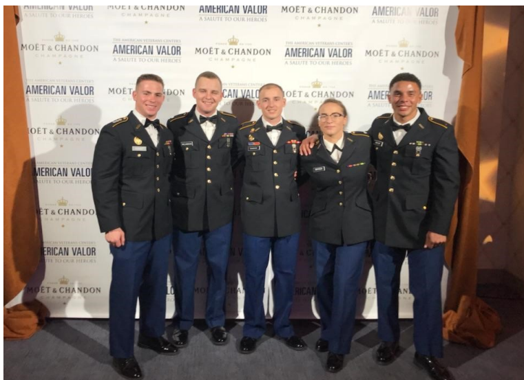
Cadets pose at the American Veterans Leadership Conference