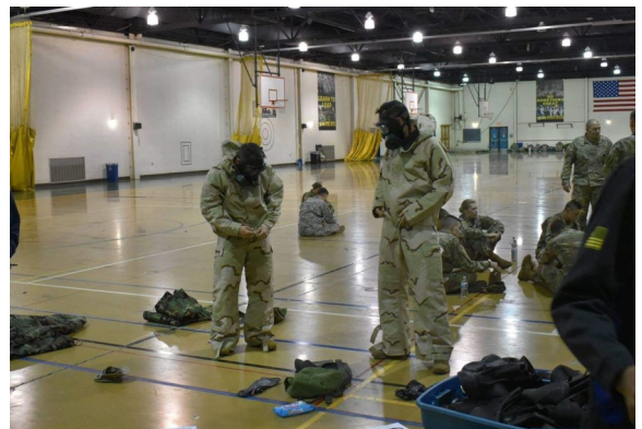
Cadets put on their MOPP Gear at GAFPB