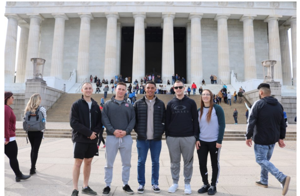
Cadets pose in front of the Lincoln Memorial