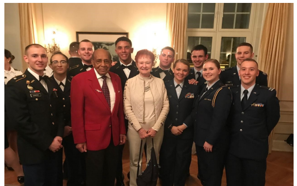
Cadets pose with one of the Tuskegee Airmen