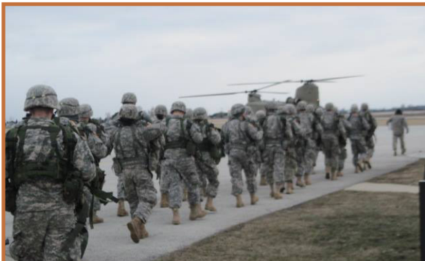
Cadets board a Chinook helicopter. MS I and II Cadets rode in a Chinook to the training area.