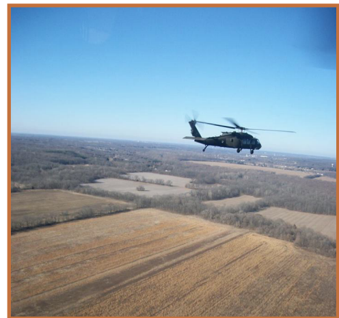
A Blackhawk helicopter with BGSU ROTC Cadets flies to the training area in Fort Custer, MI