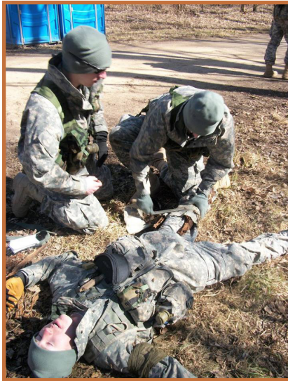
Cadets practice how to use an improvised splint in a casualty evacuation lane.