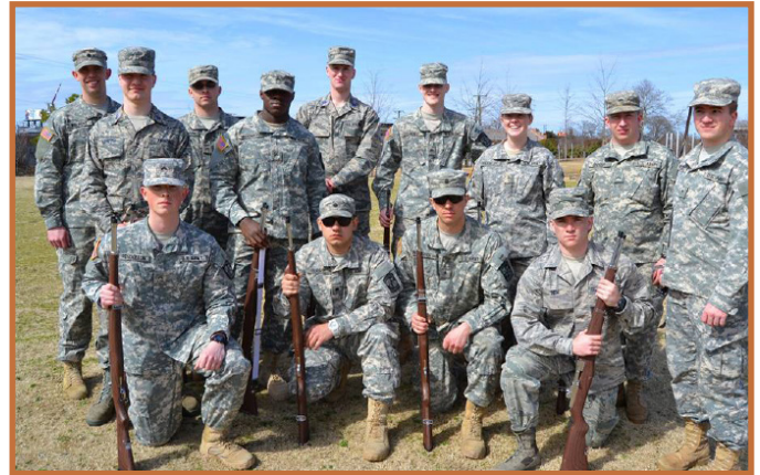
Pershing Rifles Company I-1