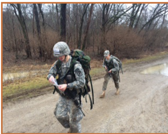
Cadets at the Best Ranger competition complete the final event of the day, a seven mile road march.